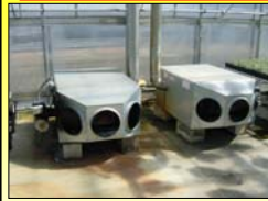
Hot air furnace