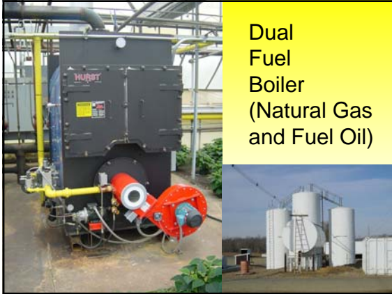
Dual Fuel Boiler (Natural Gas and Fuel Oil)